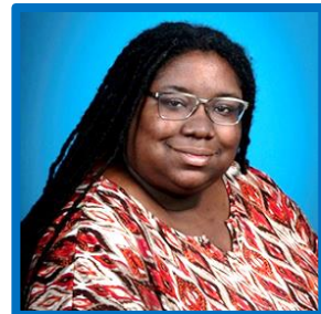
Senator Nicholle Young