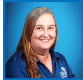
Senator Cindi Wetherwax