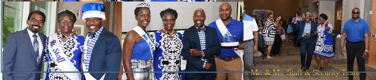
Mr. & Mrs. Staff & Security Team